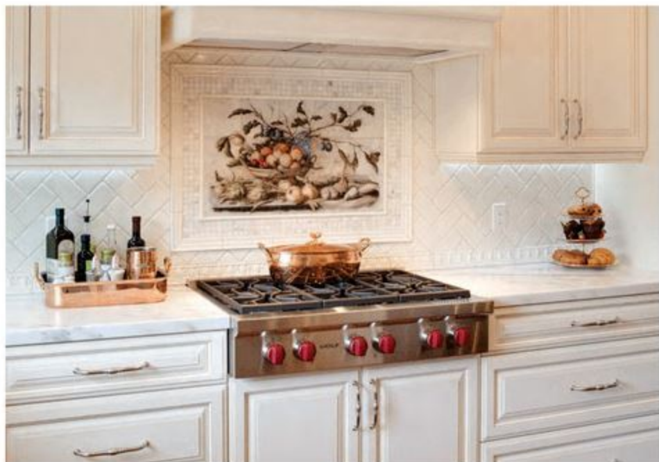
Kristin added warm, classic touches—a refined backsplash and copper elements—to complement the antique light fixture in this clean-lined kitchen filled with touches of the past.