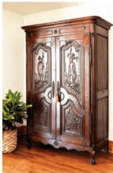
energy you enjoy in your spaces when choosing standout pieces.